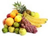
Fruits, especially whole fruits