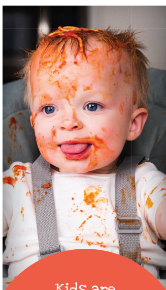
Kids are a mystery. Finding quality child care doesn't have to be.

We hope to see many more child care providers get started on the path to becoming Quality Rated!