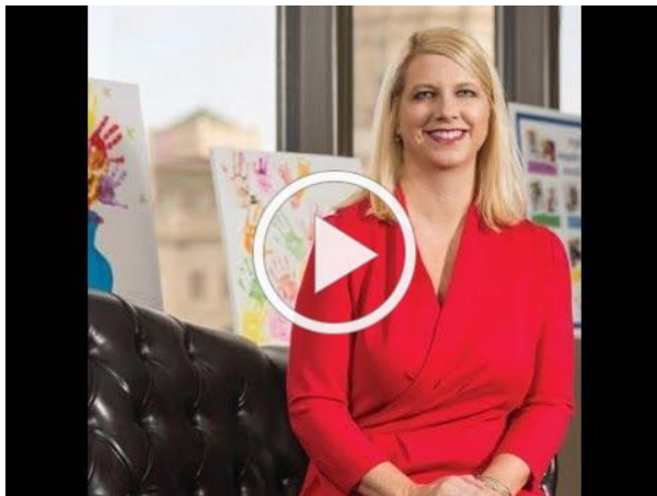
Webinar on 2018 CCDF Discretionary Funds