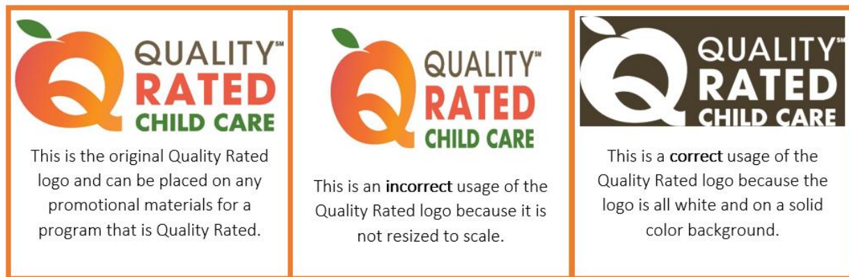
Examples of Correct and Incorrect Design Uses of the Quality Rated Logo